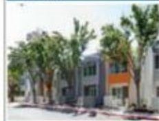
Housing Authority of the County of Santa Clara