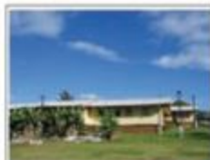
Hawaii Public Housing Authority