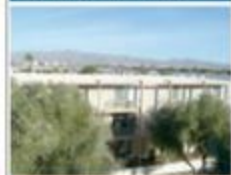
Southern Nevada Regional Housing Authority