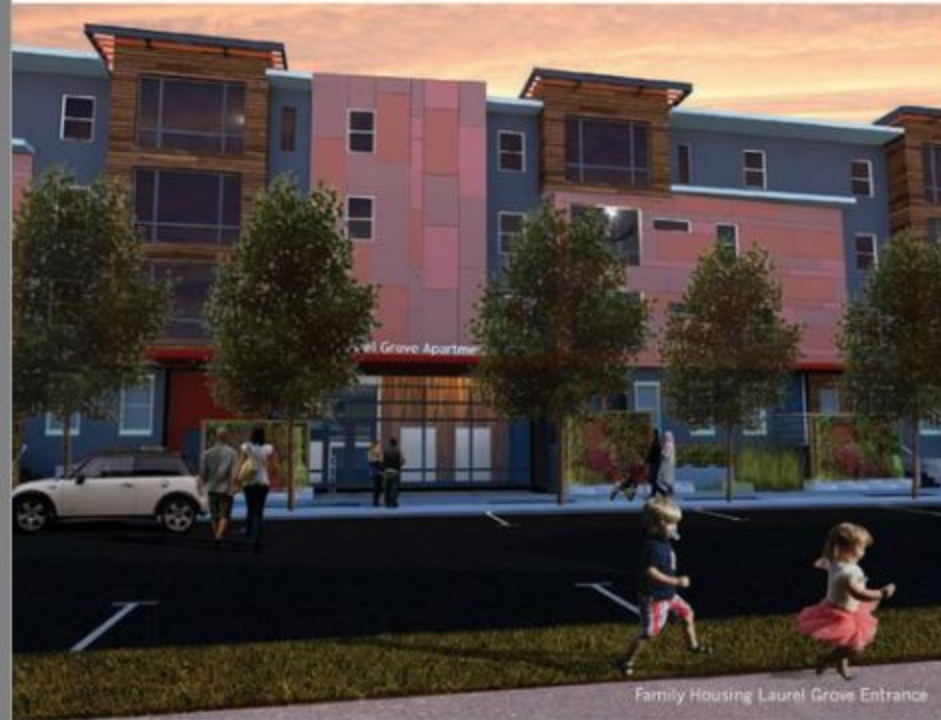
Family Housing Laurel Grove Entrance