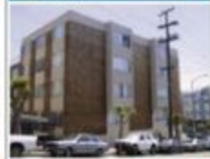
San Francisco Housing Authority