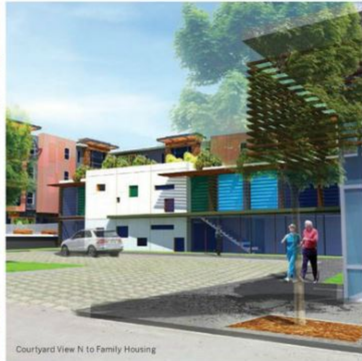
Courtyard View N to Family Housing

Silicon Valley is known as the hub of the technology industry, which continues to boom and attract high-income professionals to the region. However, for the Housing Authority of the County of Santa Clara (HACSC), extreme challenges are associated with rising rents for those who do not make enough money to afford them.